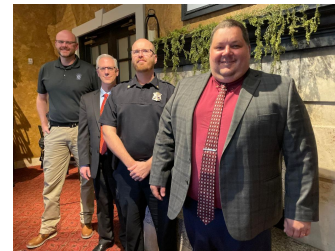
One of four police chaplains with township staff

Volunteers are a key component of Miami Township operations. The Zoning Commission, Board of Zoning Appeals and our police chaplains are all dedicated to making a difference in this community. They assist us with zoning issues, development plans, business design, and support for our police officers.