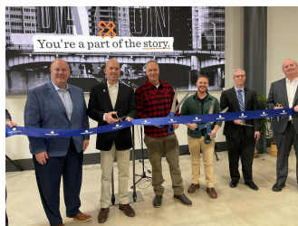
We are happy to