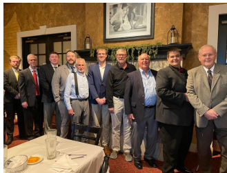
Board of Zoning Appeals with township staff