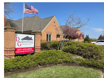
D&G Roofing will hold