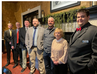
Zoning Commission with township staff