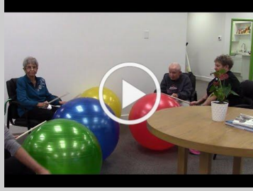
Harmony Adult Day Services 8934 Kingsridge Drive