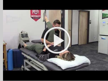
NovaCare Rehabilitation Services 2010 Miamisburg-Centerville Rd.