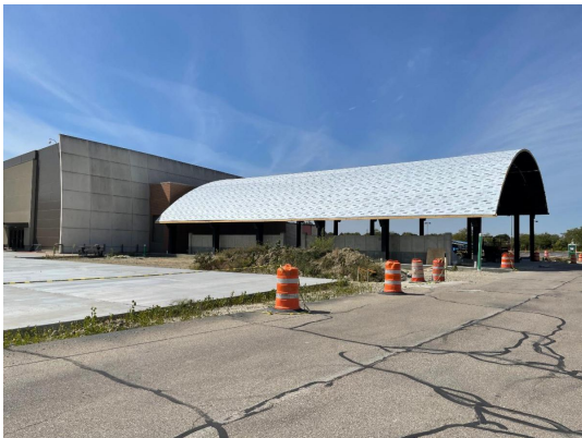
Southbrook Church - Washington Church Road