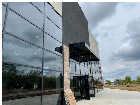
Oasis Turf & Tree at Byers Road near Benner Road