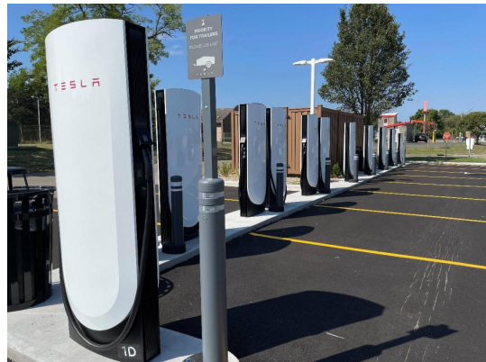
Tesla charging stations - SR 741 in Meijer outlet