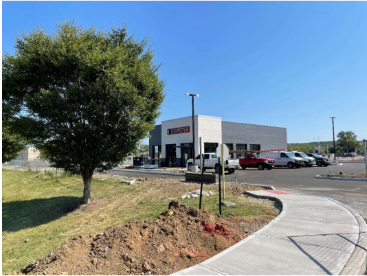
Chipotle - SR 741 at Alex Bell Rd.