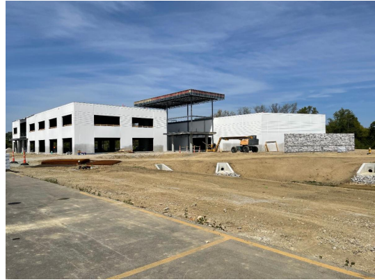
Rushlight/CRG - Washington Church Road